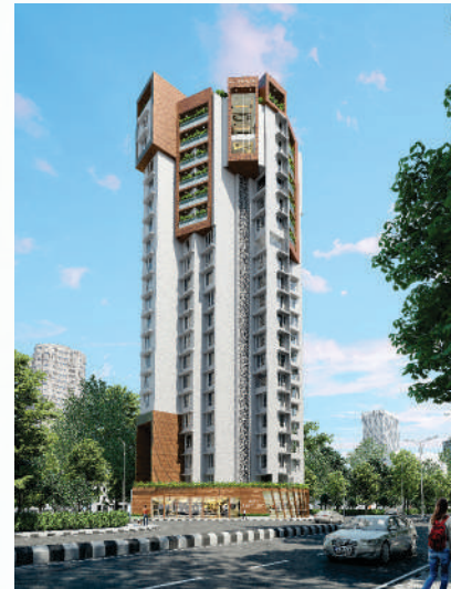
Dipti Royal Arc Shivaji Park, Dadar (W)

Project Address: _____ Plot No.10, Hindu Friends Society Rd, Natwar Nagar, Jogeshwari East, Mumbai - 400060