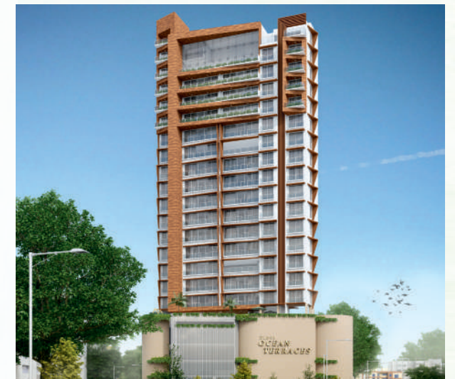
Dipti Ocean Terraces Shivaji Park, Dadar (W)