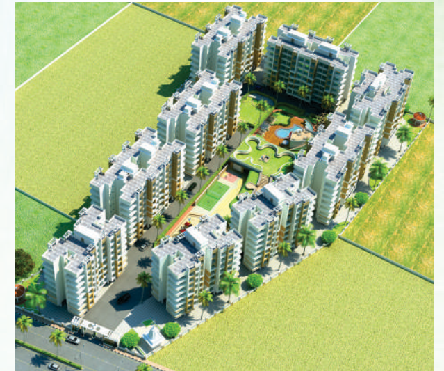
Dipti Sky City Ambarnath (E)