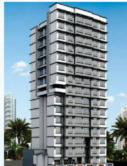
Dipti Surya CHS Ltd. Jogeshwari (E)